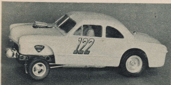
This unidentified gasser is just another example of the sanitary entries on hand.